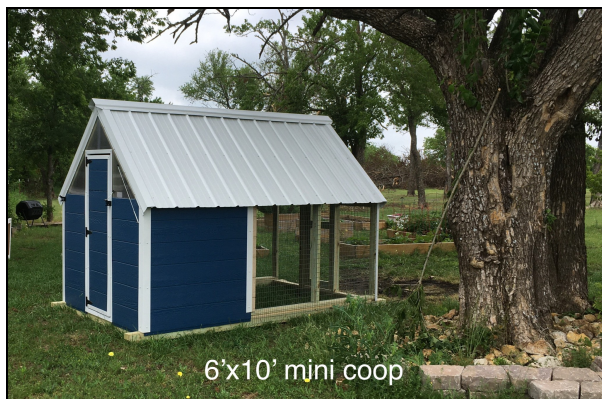
6'x10' mini coop