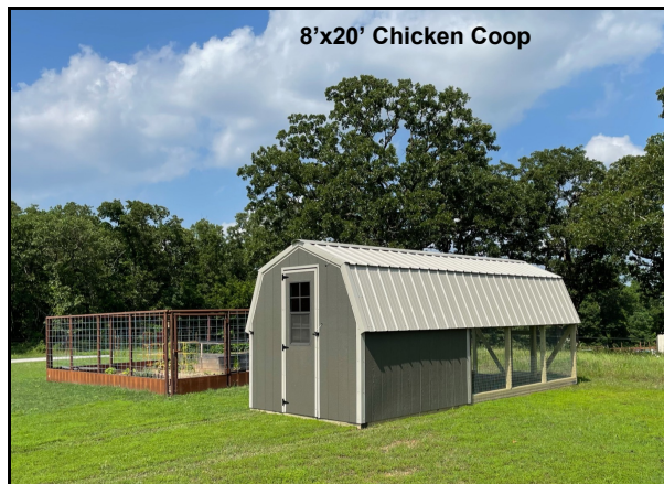
8'x20' Chicken Coop