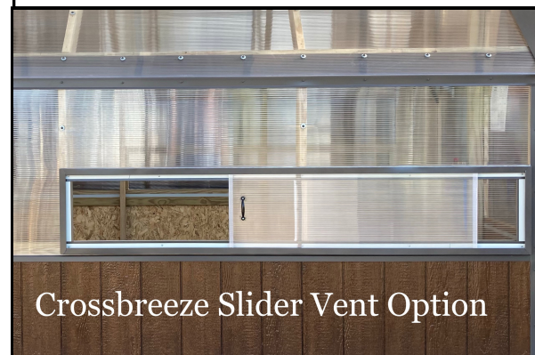
Crossbreeze Slider Vent Option