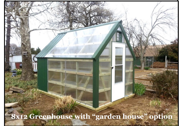
8x12 Greenhouse with "garden house" option