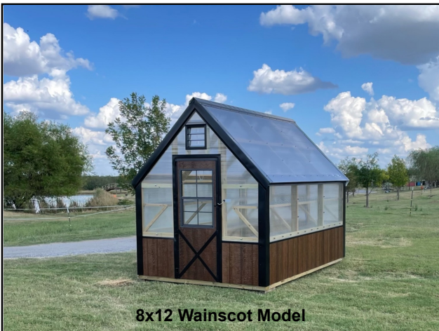
8x12 Wainscot Model