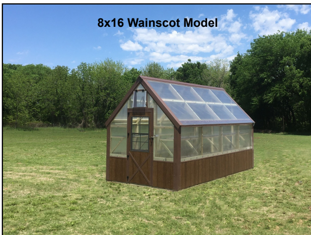
8x16 Wainscot Model