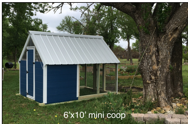
6'x10' mini coop