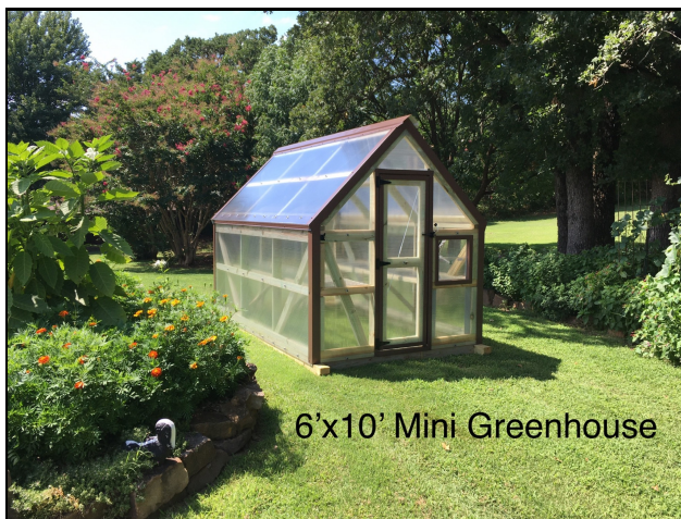
6'x10' Mini Greenhouse