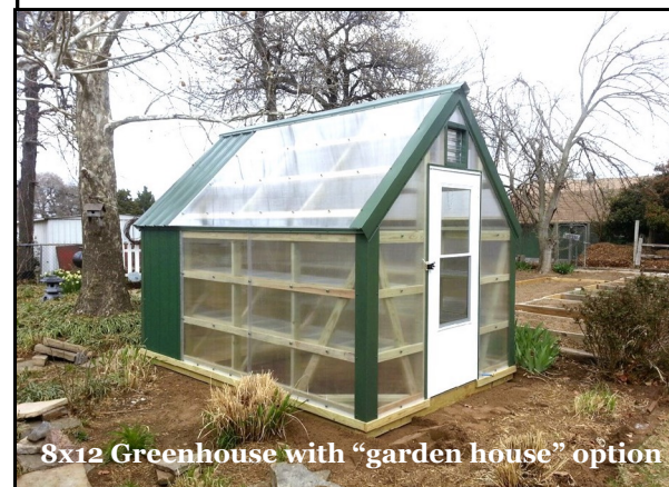
8x12 Greenhouse with "garden house" option