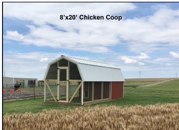
8'x20' Chicken Coop