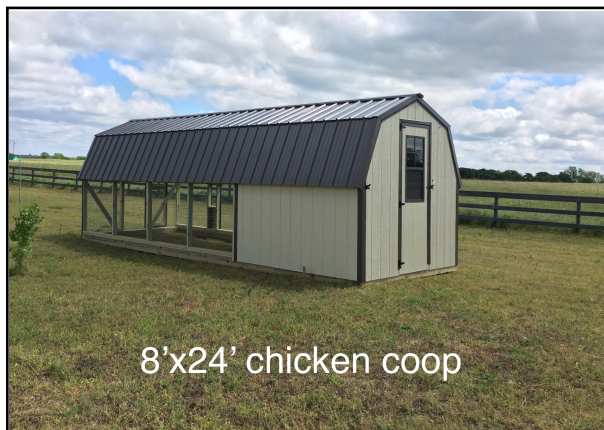
8'x24' chicken coop