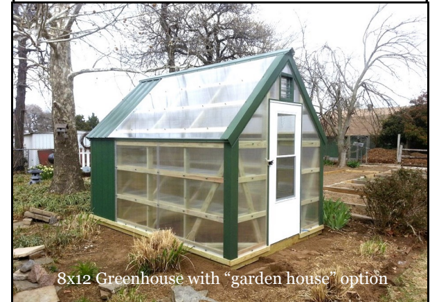
8x12 Greenhouse with "garden house" option