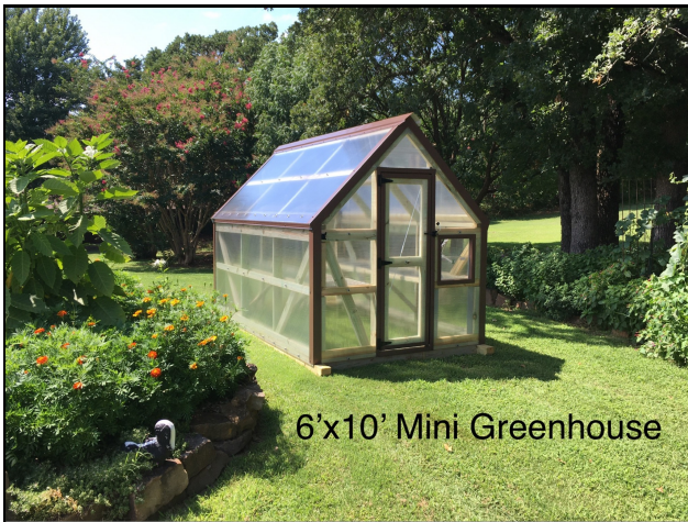
6'x10' Mini Greenhouse