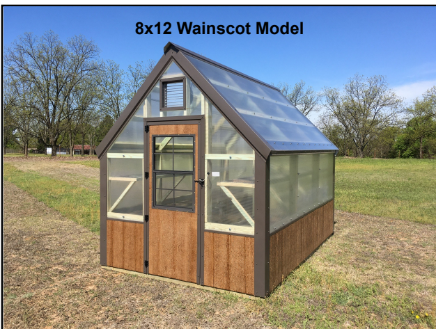
8x12 Wainscot Model